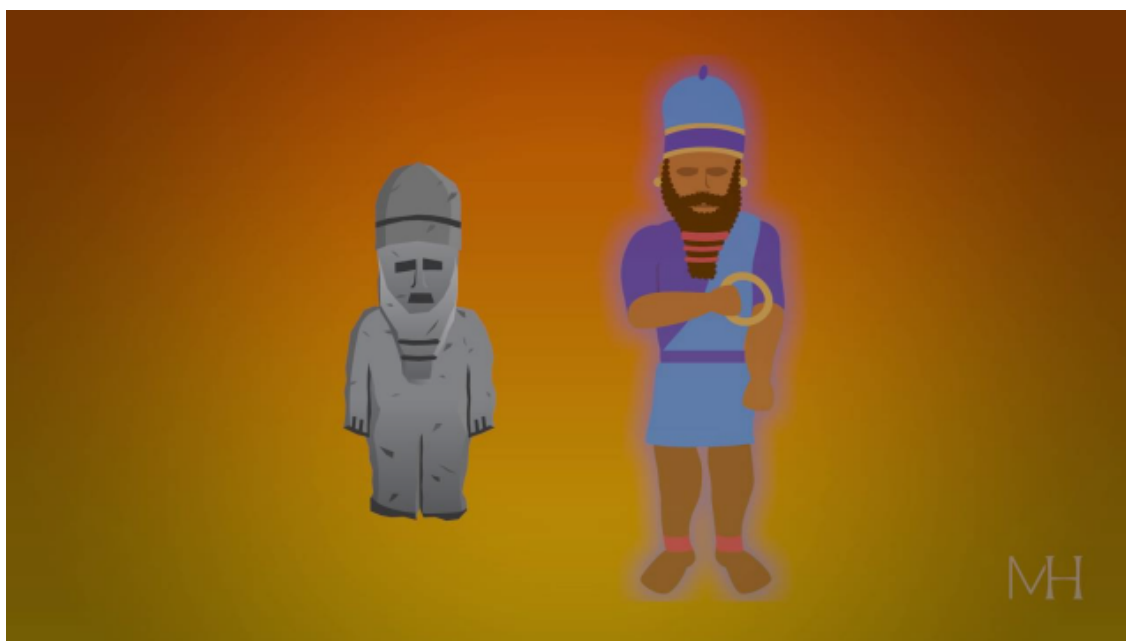
Latest Motion Graphic Video: The Gods of the Bible, Part 1

List of Open Access (Mostly Free) Online Journals in Ancient Studies